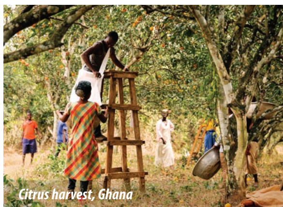
Citrus harvest, Ghana