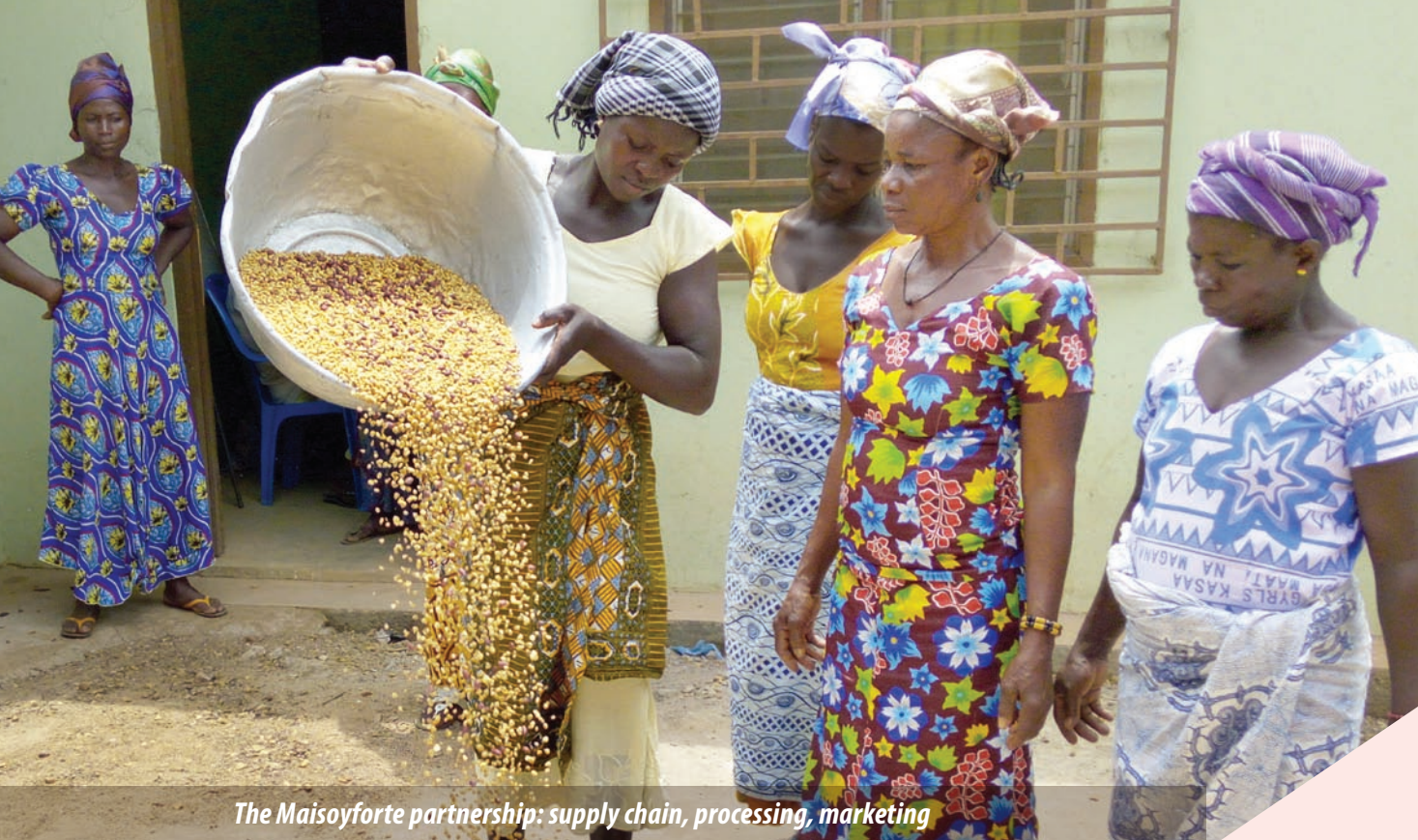
The Maisoyforte partnership: supply chain, processing, marketing