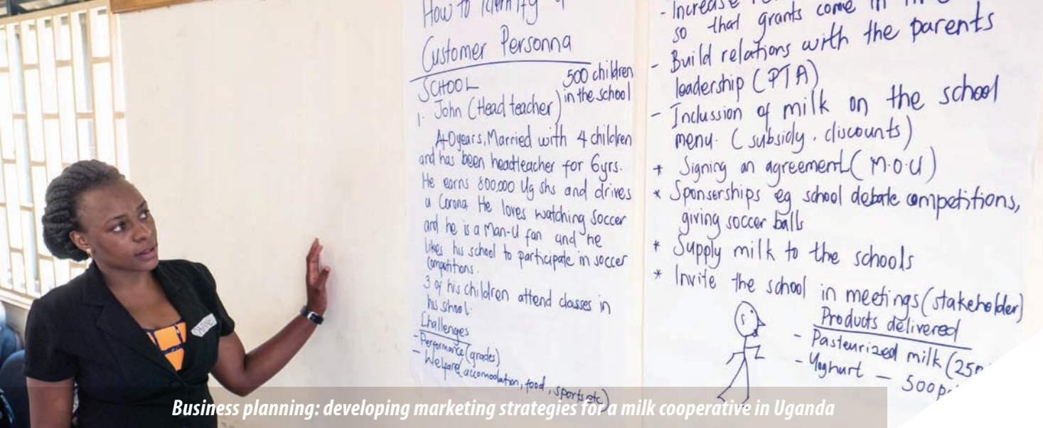
Business planning: developing marketing strategies for a milk cooperative in Uganda

Weight and moisture are often contentious issues when farmers deliver grain to a buyer. In Kenya, we helped sorghum processor Shalem introduce weighing scales and moisture meters – no more arguments! Shalem also acquired a mobile dryer that moves to different collection points during the harvest season. Sorghum with high moisture content is no longer rejected but dried, inspected and purchased. This simple intervention has dramatically improved quality as well as relationships.