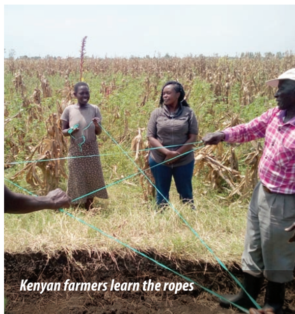
Kenyan farmers learn the ropes

Building capacity is not just transferring knowledge, but empowering farmers to experiment and learn-by-doing. We launched a farmer-led research program in Benin, where pineapple farmers selected three innovations (plastic mulch, blended fertilizer, planting shoots) that had succeeded elsewhere, but required fine-tuning to suit local conditions. Farmers conducted the tests on their own fields, and adoption grew rapidly. More than 1,200 farmers now use blended fertilizers, and nearly every farmer uses