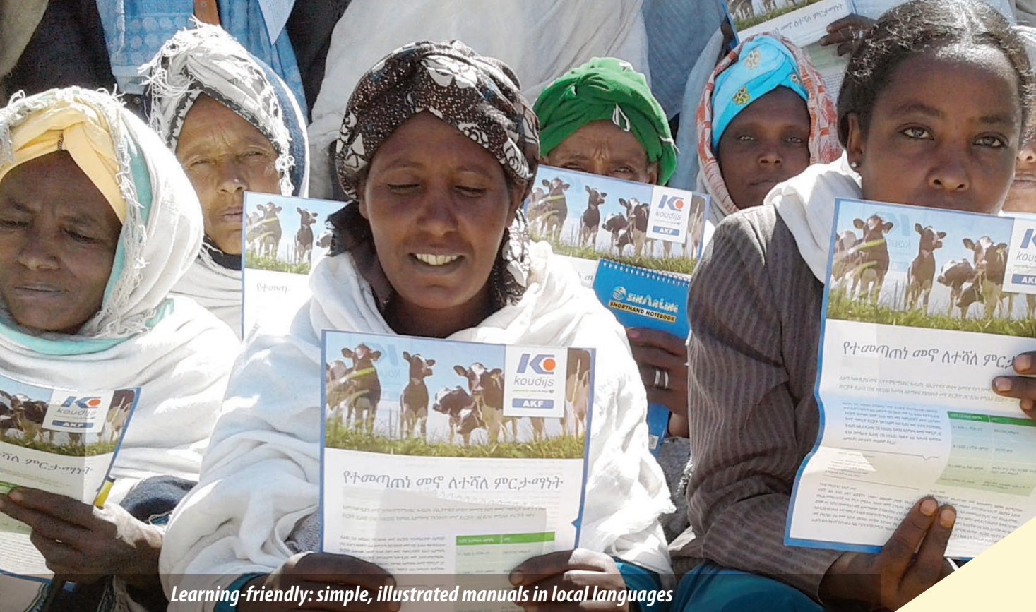
Learning-friendly: simple, illustrated manuals in local languages