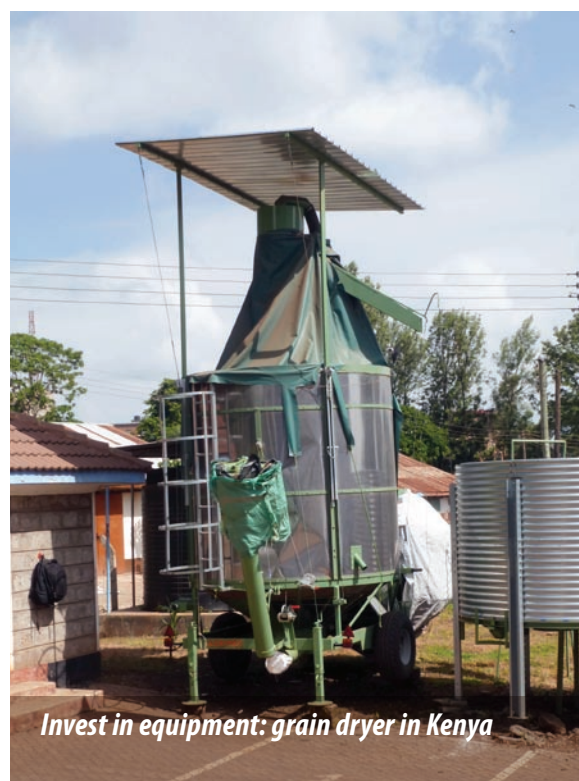
Invest in equipment: grain dryer in Kenya

In Benin, we helped broker a multi-partner arrangement between juice maker Promo Fruits, a pineapple farmers’ cooperative, FECECAM bank and input wholesalers. Before the season began, the cooperative received a working capital loan from FECECAM, ‘guaranteed’ by Promo Fruits. The money was paid not to farmers but to the input dealers for fertilizers and agrochemicals. After the crop was harvested and delivered to Promo Fruits, the cooperative deducted from individual farmers’ payments and repaid the loan.