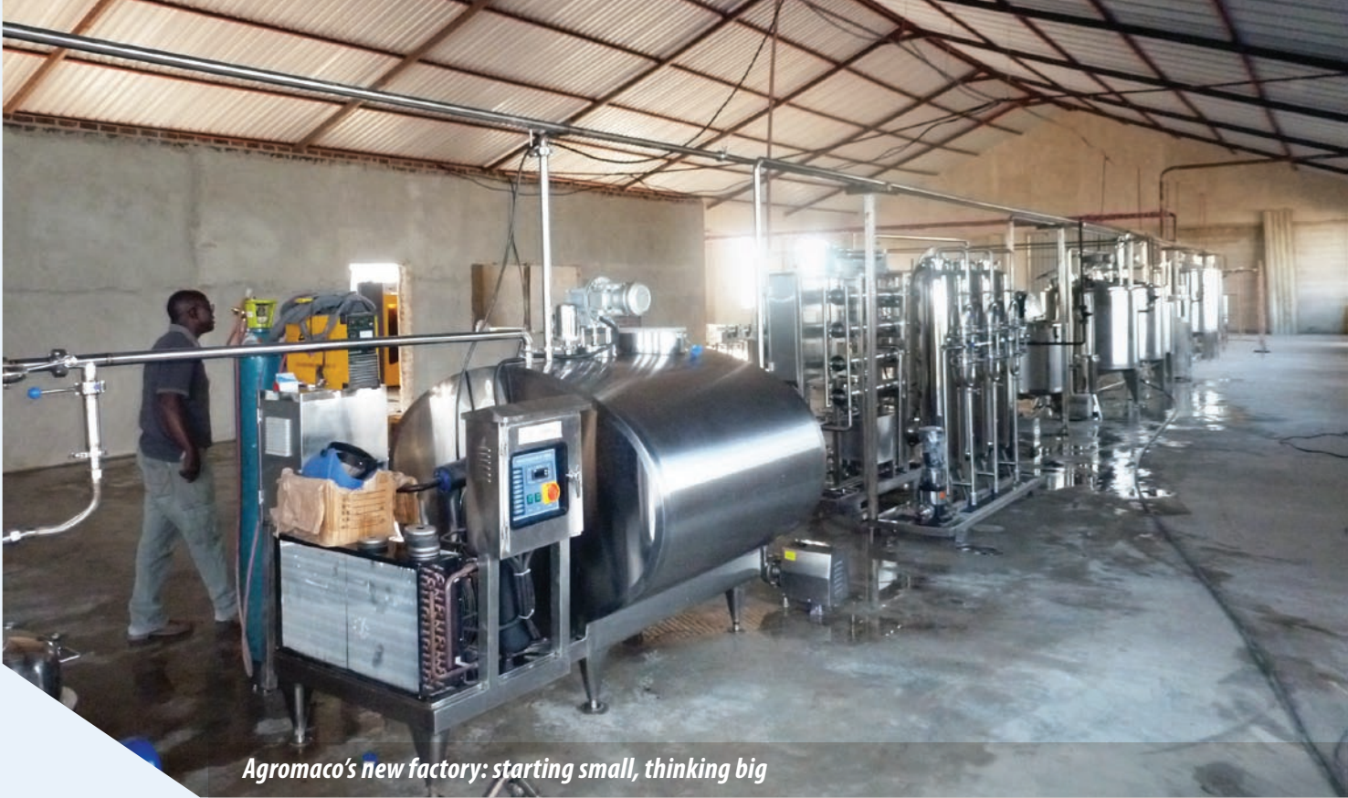
Agromaco's new factory: starting small, thinking big