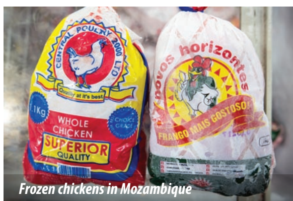
Frozen chickens in Mozambique