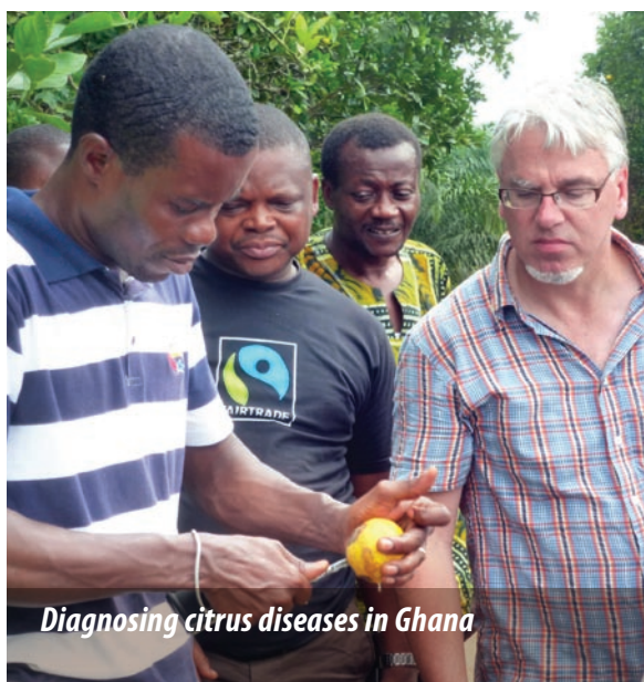
Diagnosing citrus diseases in Ghana

Capacity building programs are led by coaches based in the community, providing not just short-term training but continuous, year-round support. They also involve government extension officers as well as private firms