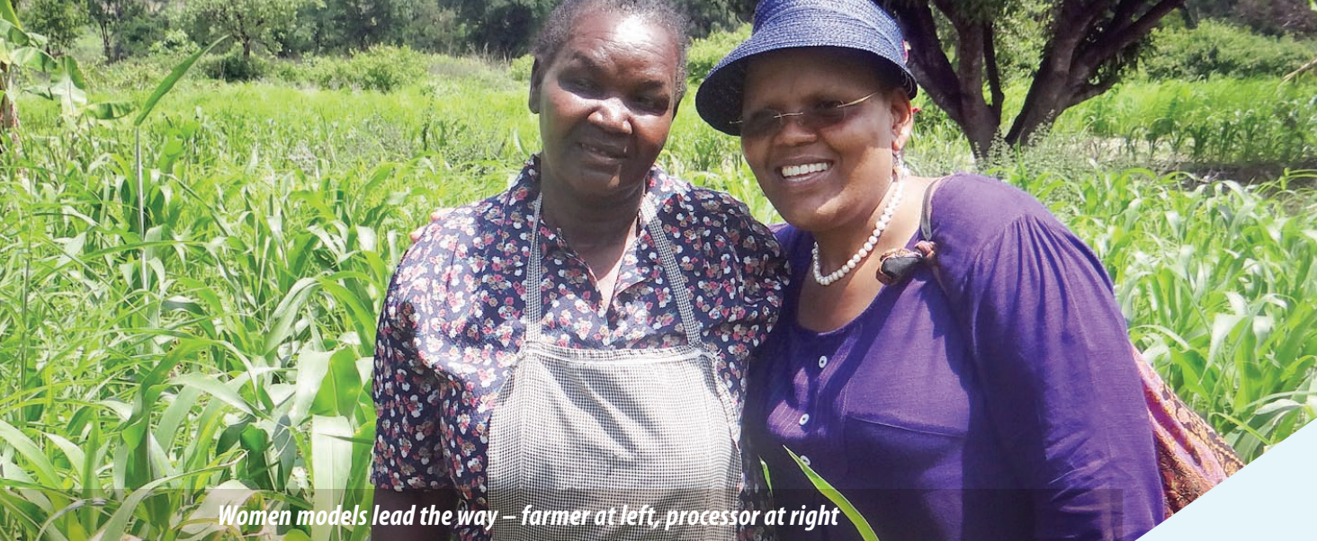
Women models lead the way – farmer at left, processor at right