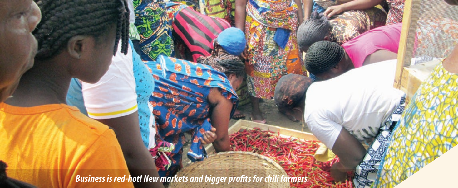
Business is red-hot! New markets and bigger profits for chili farmers