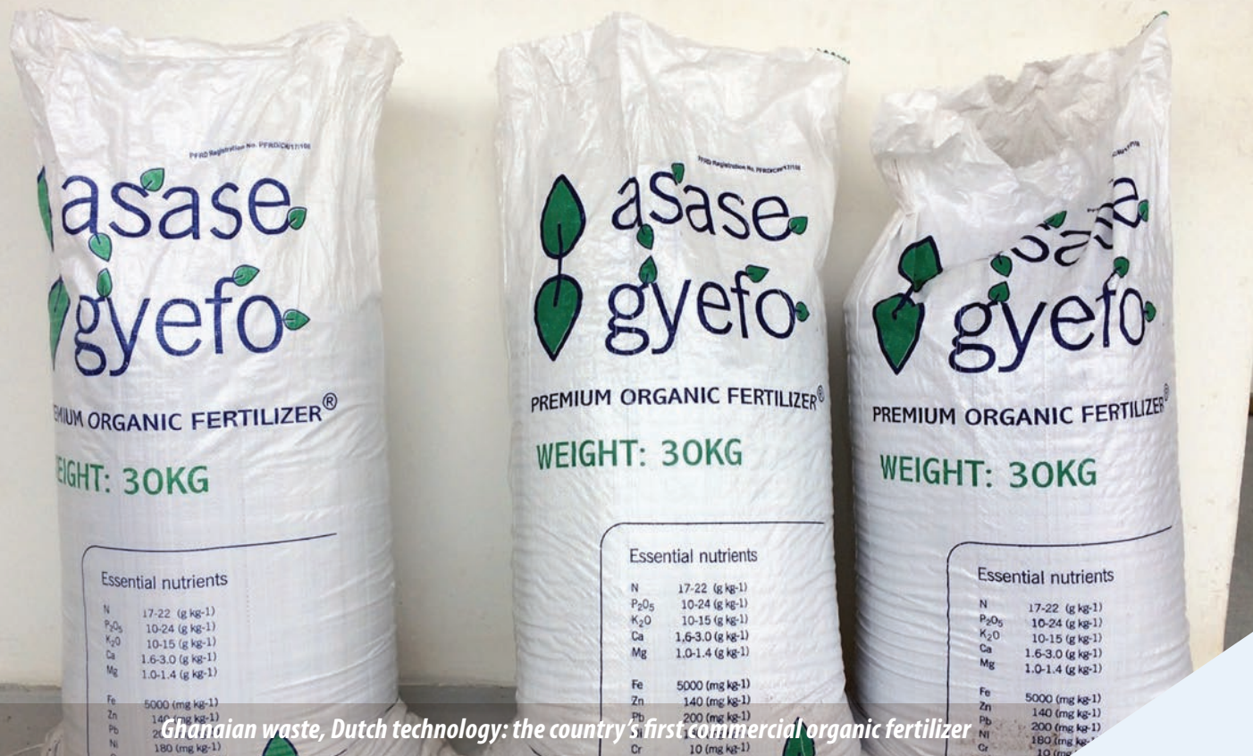
Ghanaian waste, Dutch technology: the country's first commercial organic fertilizer