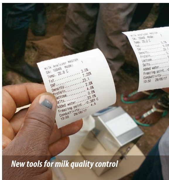
New tools for milk quality control

These 'apex bodies' have also accelerated technology adoption by offering a bulk market for specialized inputs – for example, Rhizobium inoculants for soybean farmers in Uganda, or customized fertilizers for pineapple farmers in Benin.