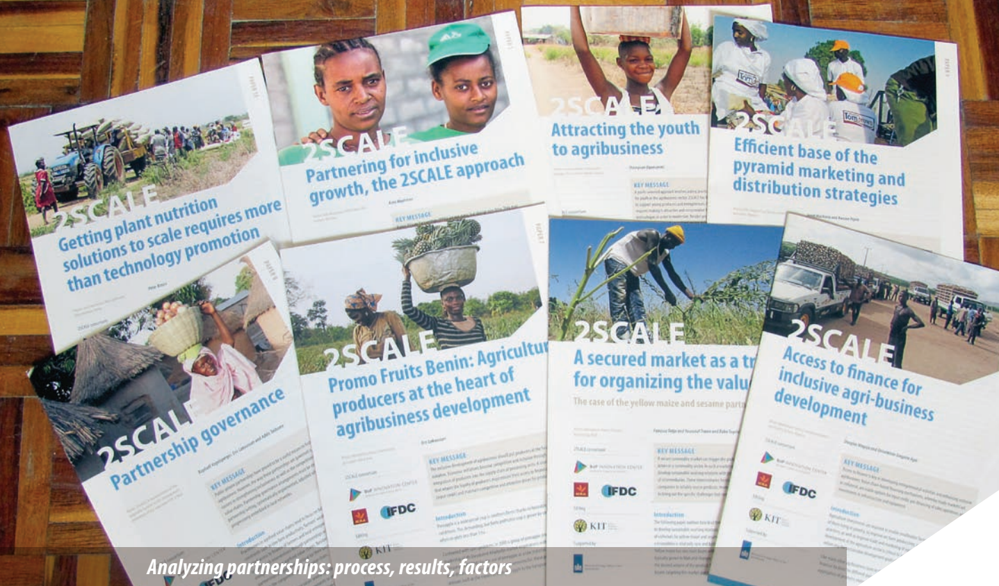
Analyzing partnerships: process, results, factors