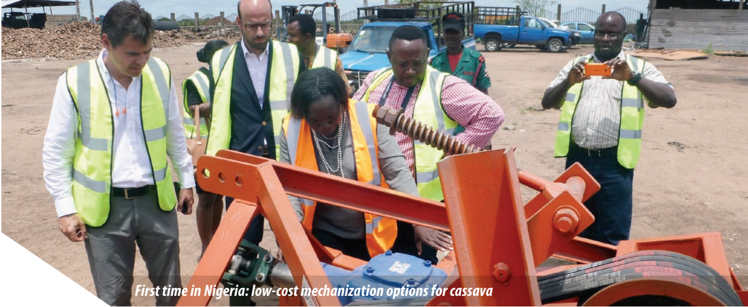
First time in Nigeria: low-cost mechanization options for cassava

expertise can be shared and successes replicated across Africa. The portfolio includes multiple sectors – food staples (e.g. maize, rice, cassava), green vegetables, potatoes, oilseeds and livestock.