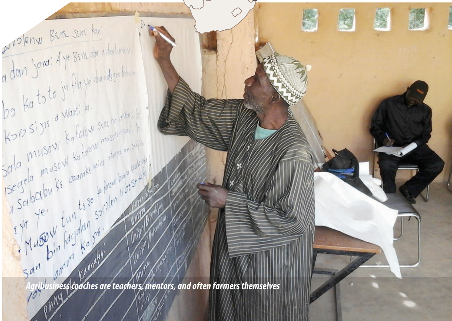
Agribusiness coaches are teachers, mentors, and often farmers themselves