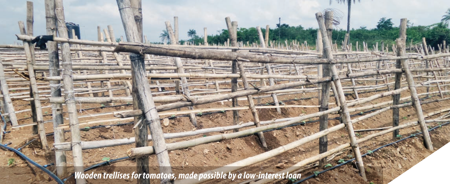
Wooden trellises for tomatoes, made possible by a low-interest loan

entrepreneurs (700 women) in Ghana, and more than 7,000 in Kenya, created VSLAs. Three groups of rice farmers in Ghana collectively saved $64,000 in 6 months. VSLA savings can help convince banks that farmers are credit-worthy. For example, sorghum farmers in Kenya set up more than 200 VSLAs, with 6,000 members – and have been able to raise $60,000 in loans. Soybean farmers in Uganda have formed more than 400 VSLAs, each with its own ‘savings box’; and then leveraged these savings to borrow $70,000 (multiple small loans to VSLA members) from the formal market.