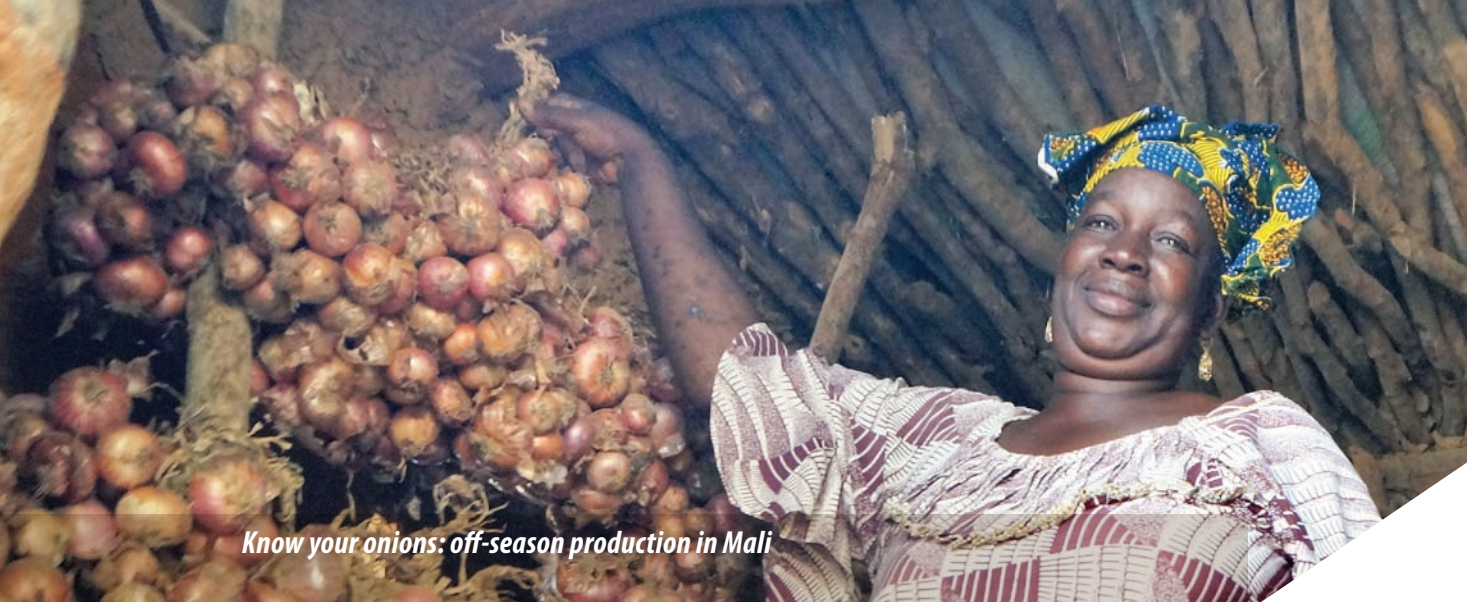
Know your onions: off-season production in Mali

supplying (and providing training on) seeds, fertilizers or mechanization. One example is the rice partnership in Kenya. Demonstration plots were established in every cluster, allowing farmers to compare traditional vs improved practices. Thirteen field days, organized by the private sector, attracted more than 2,400 visitors (1,147 women), including traders and input retailers wanting to do business with rice farmers. To date, the training program has reached nearly 6,500 rice farmers. Yields have increased from about 1.5 ton to 2.5-3.5 tons per hectare. In addition, larger harvests have generated a substantial market in rice straw, sold to dairy farmers.