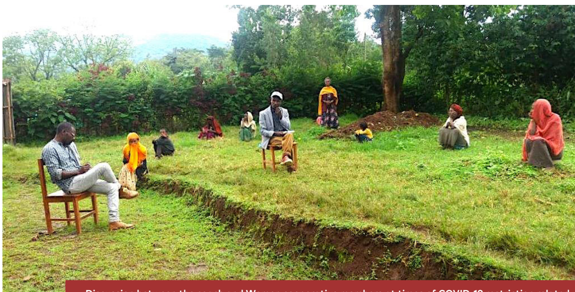
Discussion between the coach and Women cooperative members at times of COVID-19 restriction related to the supply of Spice seeds and plantation at Detcha Woreda, Kaffa Zone, SW Ethiopia

In general, the employment opportunity not only brings change on incomes and economic empowerment but also capacitates women technically. Employees getting trainings and consistent assistance from the coach hired by Damascene, feel enlightened and get an opportunity to apply the learning through technical seedling farm activities. Both women who were interviewed, stated that the coaching