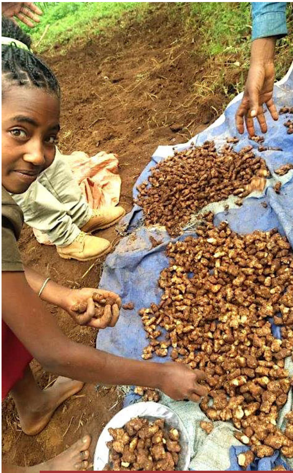
Youth Woman farmer receiving Ginger seeds from the cooperative on credit terms, Detcha woreda,

building, producer group strengthening, better access to resources and services and market opportunities and linkages were implemented and mainly targeted women farmers.