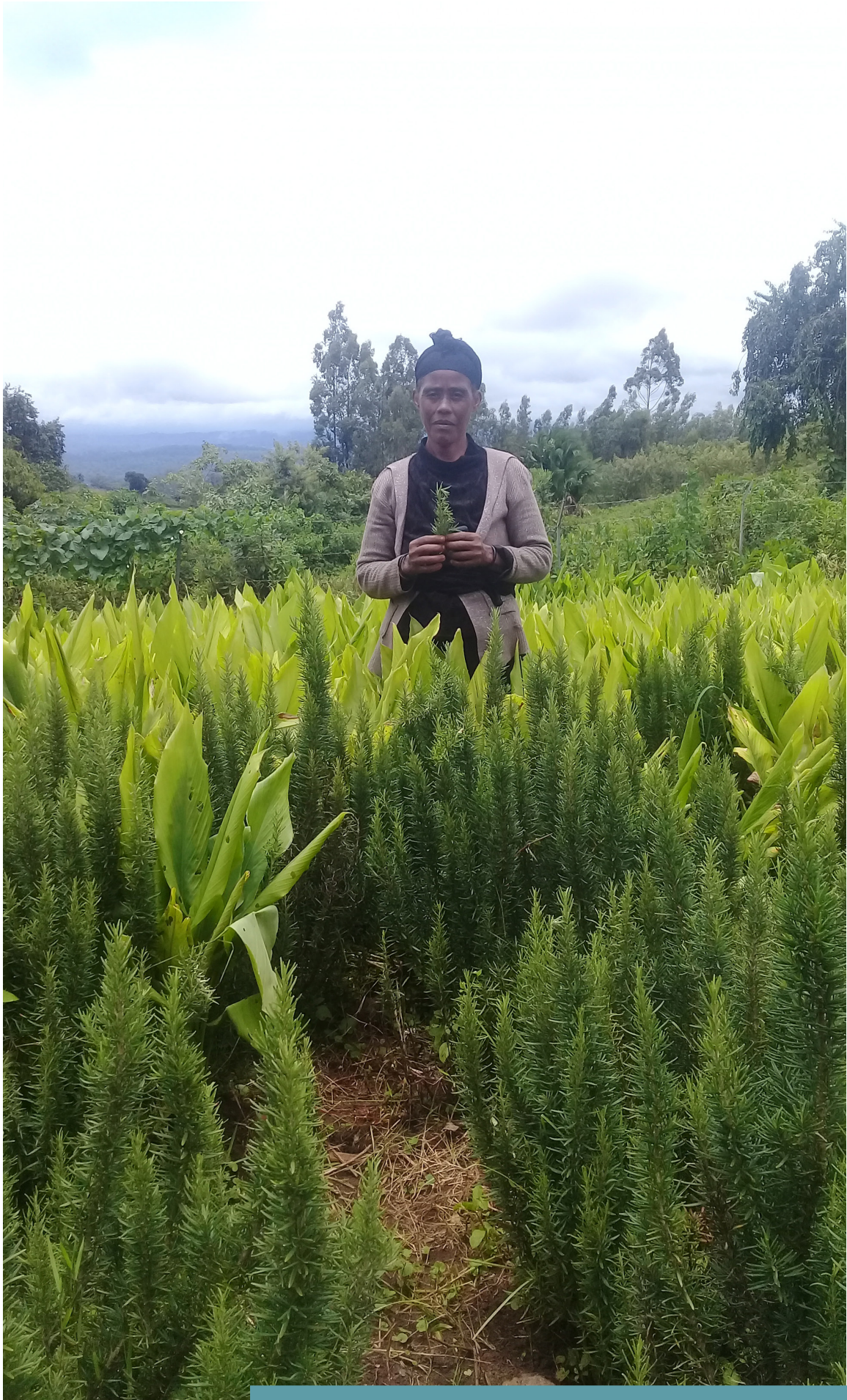
Kaffa Zone, South West Ethiopia, growing Spices & Herbs Grower in her backyard