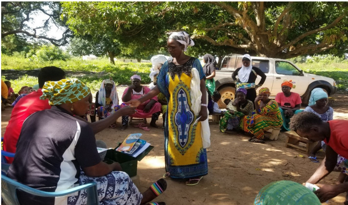
Financial literacy trainings have led to increased capacity

While access to finance is important, its management is critical to ensure pay back and avoid wasteful investment. The capacity of cluster actors must be built on lending, cash management, and investment. Broadly, financial literacy trainings are key in the financial inclusion agenda to ensure actors make informed financial decisions that will facilitate growth in their businesses.