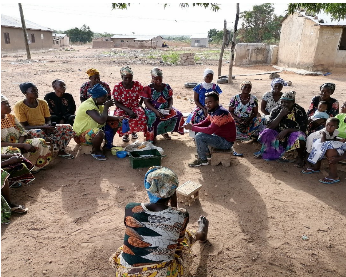
Community ownership & VSLA groups have enhanced cohesion rice and soybean farmers

In these clusters, 2SCALE supported the setup of 165 VSLAs benefiting more than 3,500 soybean and rice farmers. The VSLAs that were established in the Yedent partnership benefited from other services such as trainings in group dynamics and financial management, soya processing, as well as formal registration with regulatory bodies in Ghana as legal entities. For example, 15 VSLAs with 320 members (all women) received training not only on soybean processing but also in financial literacy in the Yedent partnership.